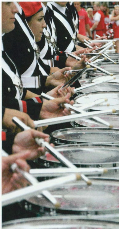
J/I Row keeps the stadium alive!