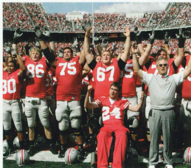
The team sings "Carmen Ohio" after the victory.