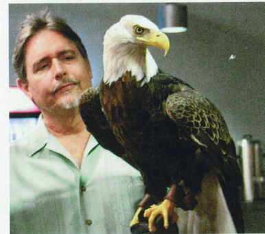
An American Bald Eagle watches over the press box during the 2009 Fiesta Bowl.