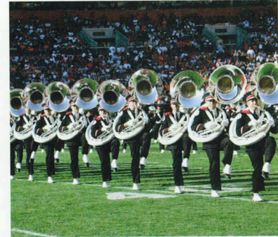
The sousaphones during "Hang on Sloopy" at the 2008 Cleveland Browns game.