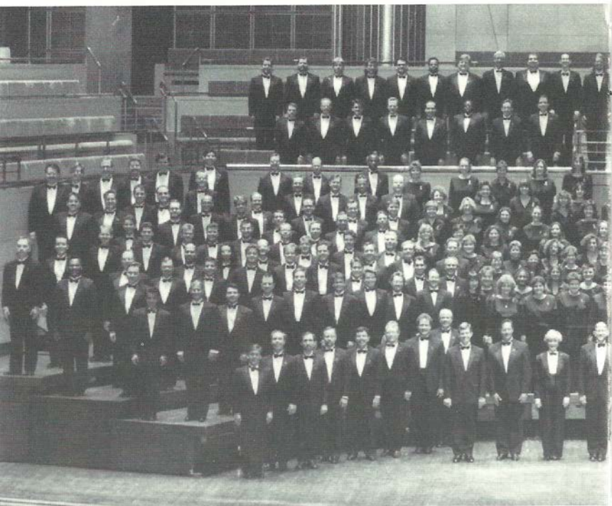
THE TURTLE CREEK CHORALE AND THE MORTON H. MEYER