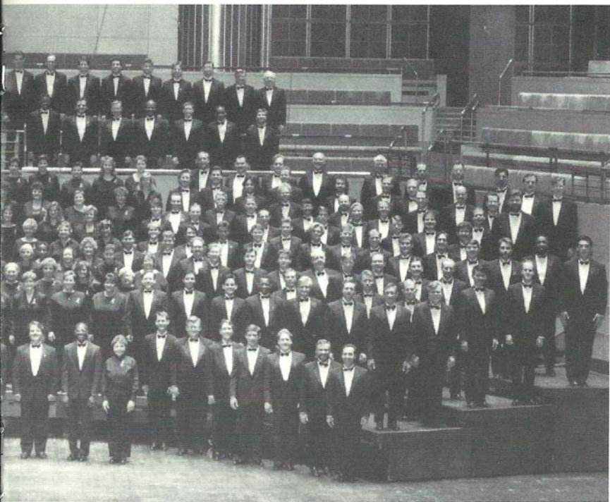
THE WOMEN'S CHORUS OF DALLAS SON SYMPHONY CENTER