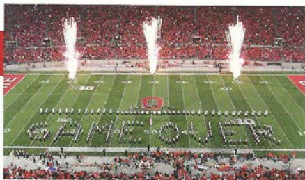
"GAME OVER" formation puts the exclamation on the band's tribute to "Classic Video Games."