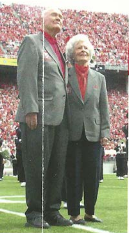
John & Annie Glenn honored at halftime on the occasion of the 50th Anniversary of Astronaut Glenn becoming the first American to orbit the earth.