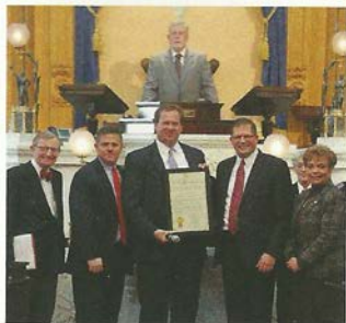
The band is honored by a Resolution from the Ohio Legislature.